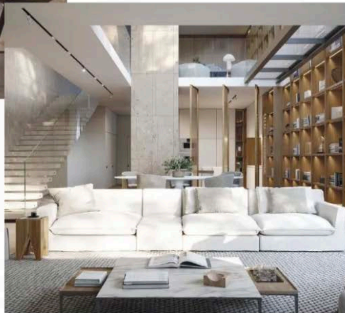
From top: A living room at Surf Row Residences, which utilizes light and nature to elevate the space; a bathroom inside the residence.