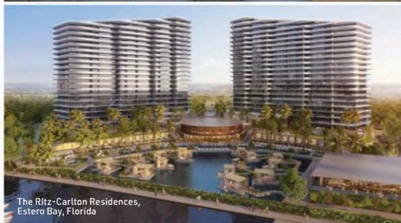
The Ritz-Carlton Residences, Estero Bay, Florida