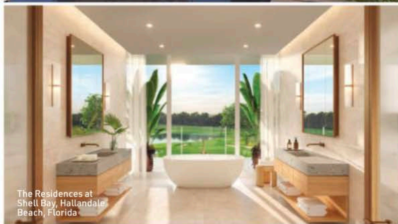
The Residences at Shell Bay, Hallandale Beach, Florida

Lineaire Group and ONE Sotheby's International have unveiled the plans for Surf Row Residences , a new residential development in Surfside, Florida. Featuring a collection of eight private beach homes designed by Rene Gonzalez Architects, residences range from three- to five-bedrooms with 3,500-5,600 square feet of indoor space. Each will have more than 2,000 square feet of private outdoor living space, which includes a rooftop with a plunge pool, a summer kitchen, an expansive gazebo, and an enclosed front yard. Pricing starts at $5.9 million. surfrowresidences.com