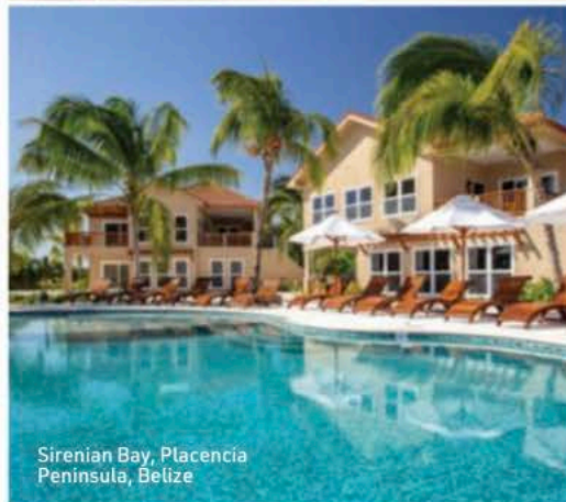
Sirenian Bay, Placencia Peninsula, Belize

The Residences at Shell Bay , an Auberge Resorts Collection, will rise 20 stories and feature 108 one- to four-bedroom residences—all with private balconies—and penthouses with private outdoor spaces, plunge pool, and outdoor kitchen. Each residence features floor-to-ceiling windows and interiors by AvroKO. The property includes a 7,250-yard Greg Norman designed championship