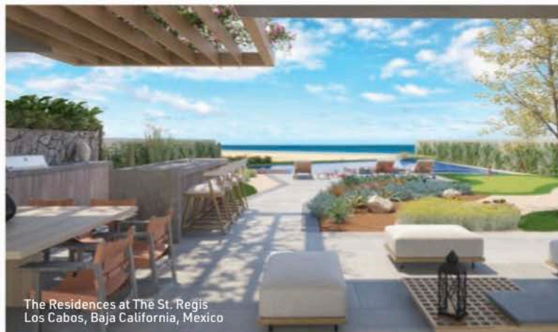
The Residences at The St. Regis Los Cabos, Baja California, Mexico