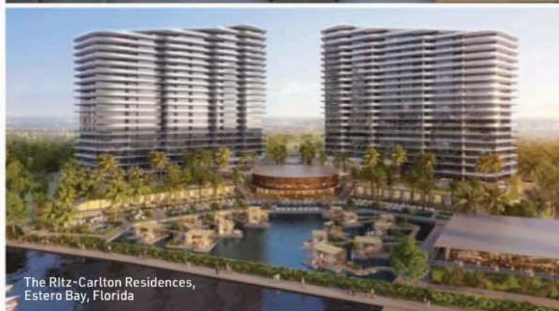
The Ritz-Carlton Residences, Estero Bay, Florida